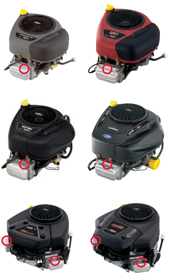
Power Built™ Series, I/C® Series™, Intek™ Series™, Extended Life Series®