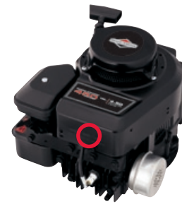
400 Series™, 500 Series™ Classic™, Sprint™, SO™, Q™