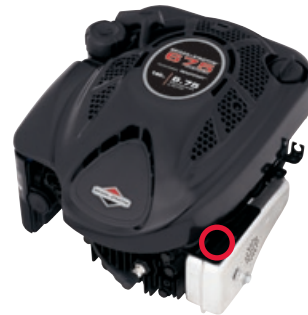
600 Series™, 800 Series™ Quantum®, Intek™